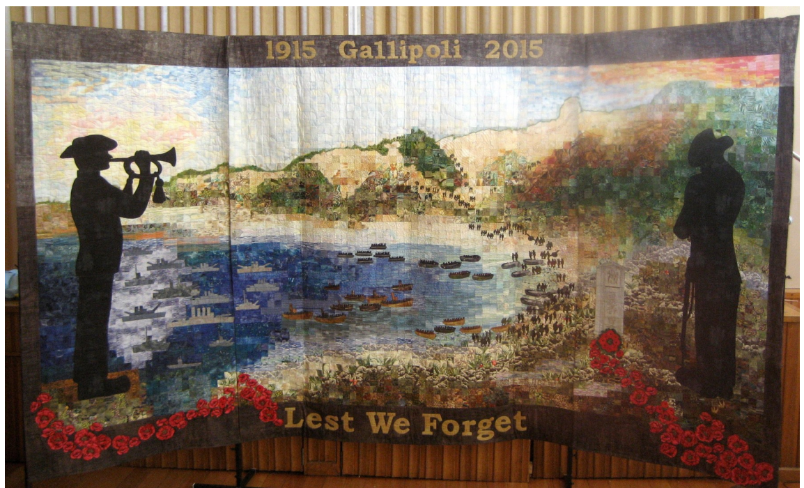
The Gallipoli Quilt