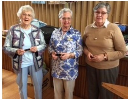
20 and 30 year badges