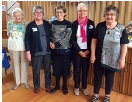
Members with 10 year badges