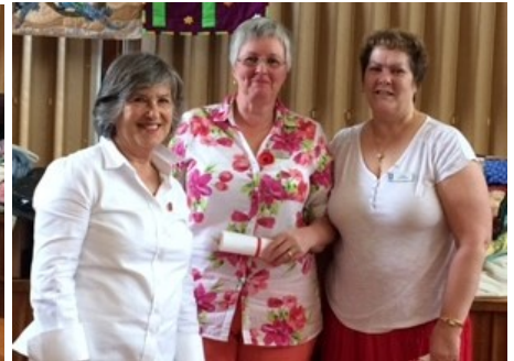
Retiring committee Members