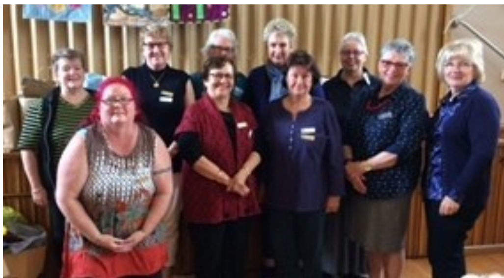
The New Committee—see names on inside.