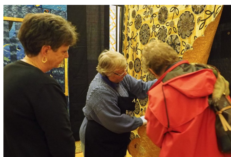
White gloves in action