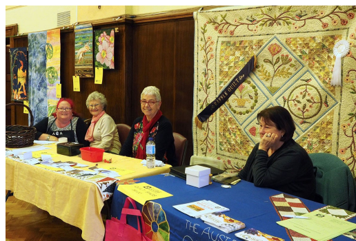
Raffle Ticket Sellers