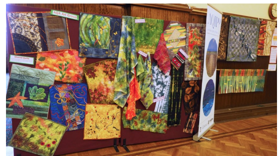
Art Quilt Group display