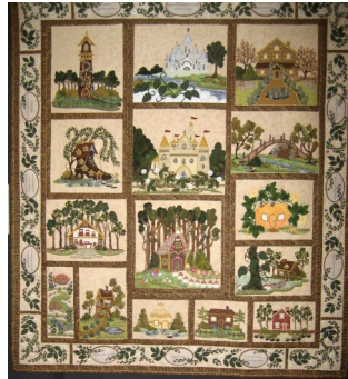
Eileen Campbell won Viewers' Choice for Please Find my Home