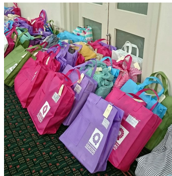
AQA Quilt bags